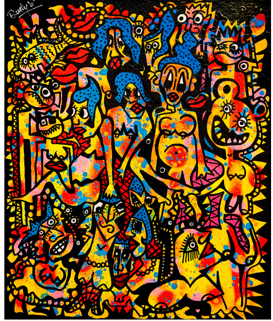
"Oompa Lumpas" (2018)