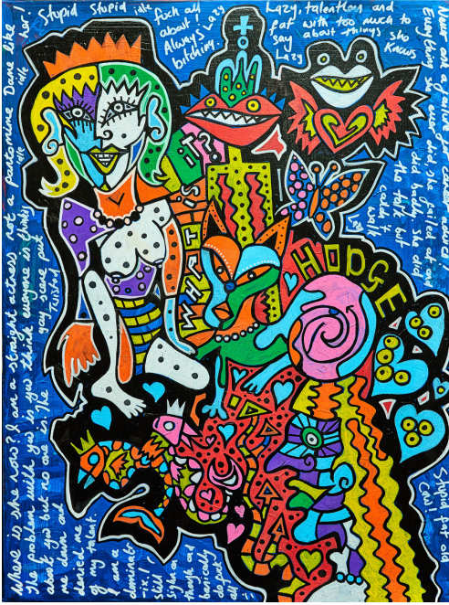
"Where Is She?" (2018)